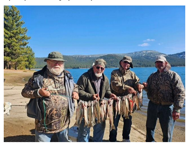
Lake Davis Success